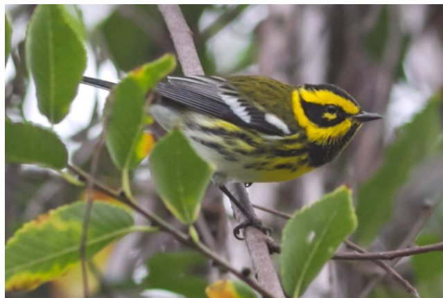
Townsend's Warbler