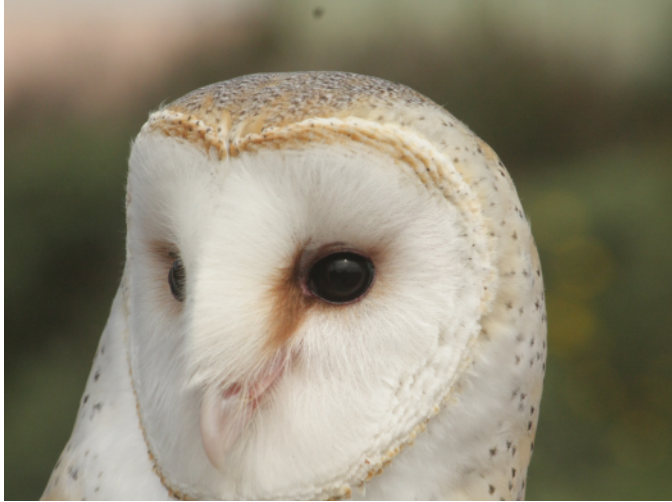
Barn Owl

D id you know there are 500 different species of birds in Los Angeles? Los Angeles is unique as it offers a wide range of habitat for birds such as mountains, deserts, beaches, and wetlands. The Pasadena area, with its oaks and proximity to the mountains, supports many beautiful birds.