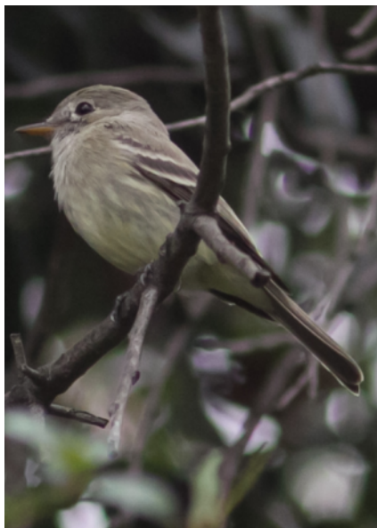
Gray Flycatcher