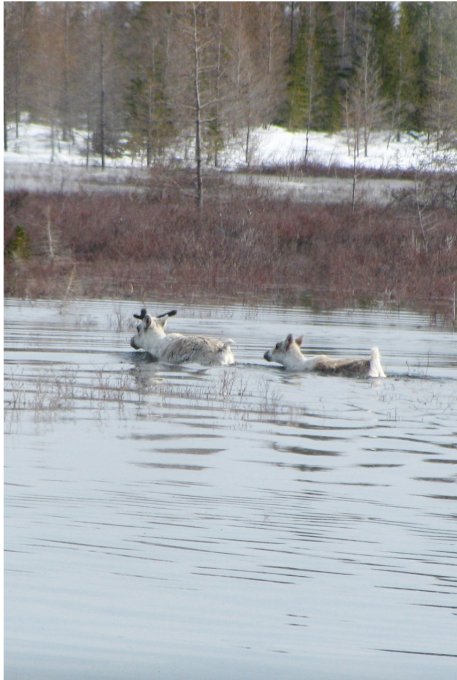
Caribou in flooded fields near Churchill

I went to Churchill, Manitoba, Canada, on Hudson Bay. This was not the Churchill of the slick, beautifully photographed advertisements. This was Churchill in the raw, freezing, thawing, raining, snowing, foggy, flooded, icy. I loved every minute of it! Best bird tour I've ever been on!