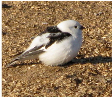
Snow Bunting (one of jillions)

because of lack of food ... no bugs, good for me, but not for them. Late breeding means that the year's hatchlings are not well enough along in their development to survive migration in some cases.