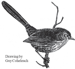
Drawing by Guy Coleleach